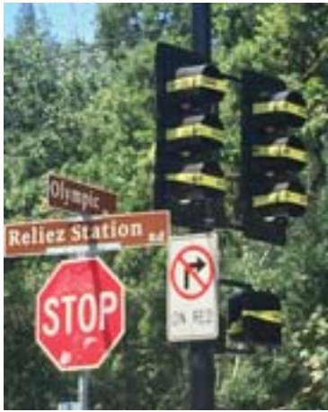
fter a flurry of orange-vest and Ahard-hat activity along Reliez Station Road in Lafayette in recent months, work on the installation of the two new sets of traffic lights stalled temporarily.

Traffic lights hit temporary roadblock By Pippa Fisher